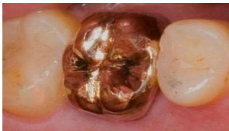
Figure 1. Metallic gold crown [10]