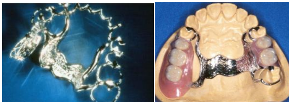
Figure 3. Applications of Co-Cr-Mo alloys [11]

a better resistance to wear and fatigue. As cast Co-Cr-Mo alloys are used for complex designs and applications (Figure 4).[11]