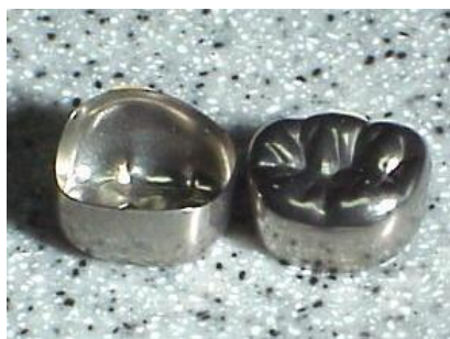
Figure 5. Stainless steel crowns [26]

composition: 17-19% Cr, 13-15% Ni and 2-3% Mo for improving the corrosion resistance and the carbon content is below 0.03%. Besides the mechanical strength, corrosion resistance is the most valuable feature of stainless steel. The addition of a minimum of 12% Cr makes steel a stainless, due to the formation of stable and passive oxide film. Since chromium has a cubic volume-centered structure (bcc), if added, it stabilizes a bcc structure of iron. However, carbon has a high affinity to the chromium, and forms carbides of \text{Cr}_{23}\text{C}_6 type. This leads to the precipitation of carbon in the carbides area wherein the chromium concentration decreases as it enters the carbide, resulting in decreased the corrosion resistance around carbide. If the content of chromium is reduced to <12%, it is not enough for repassivation and stainless steel becomes susceptible to corrosion. Stainless steel is the most commonly used for crowns (Figure 5) and in the orthodontics. [4,9]