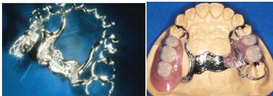
Figure 3. Applications of Co-Cr-Mo alloys [11]

a better resistance to wear and fatigue. As cast Co-Cr-Mo alloys are used for complex designs and applications (Figure 4).[11]