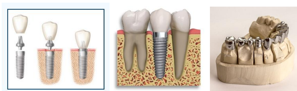
Figure 4. Titanium dental implants and crowns [16-18]

Titanium is a very popular metal in dental medicine and it is an integral part of dental treatment since the 1960s due to its good properties, such as low density (4.51 g/cm 3 ), low elastic modulus (110 GPa), and compatibility with the tissues of the mouth. The high price of precious metals and the potential health harmfulness of some metals have led to the widespread use of commercially pure titanium (CP Ti) and its alloys, especially for dental implants and crowns (Figure 4). The main advantage of the titanium implant is based on good osseointegration with the bone of the jaw. Due to the low density it is applied to produce the high-strength and lightweight dentures. [2,13-15]