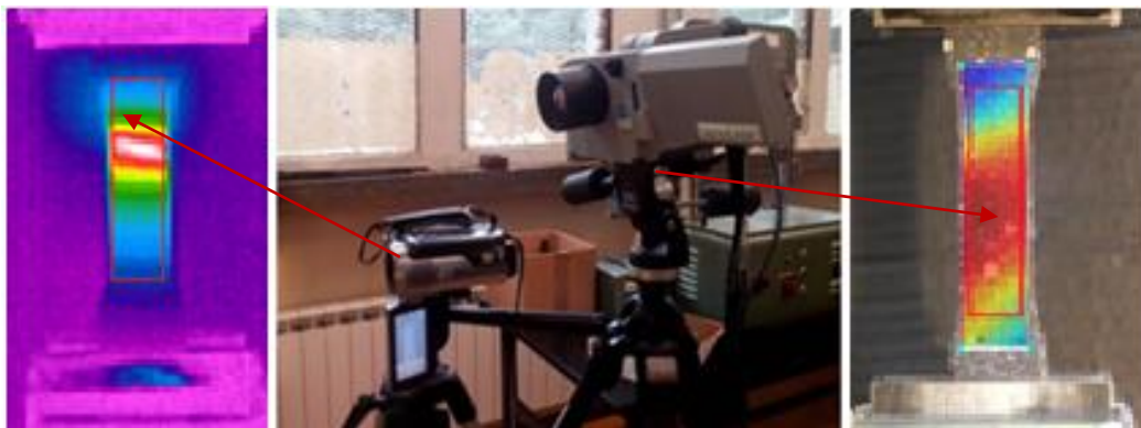
Figure 1. The arrangement of the measuring equipment as well as the deformation zone analyzed by the thermography and DIC methods

For the proposed model, at first it was necessary to experimentally determine the stresses, strains and temperature changes in the deformation zone during the stretching of samples. For this purpose, at the same time, during the static tensile testing on the Zwick 50 kN testing machine, the deformation of samples was recorded with an infrared and optical digital camera. The maximum stress values during the experiment were obtained from the diagram recorded by the static tensile testing machine. By a subsequent analysis of recorded deformations, using the methods of thermography and DIC, the values of temperature changes and strains were determined during the testing period. The maximum values of temperature changes and strains at the points of maximum stresses were determined. The arrangement of the measuring equipment as well as the deformation zone analyzed by the thermography and DIC methods are shown in Figure 1.